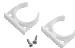
clips 60 mm with screws

available for IN LINE HOUSING CODE RB7403014